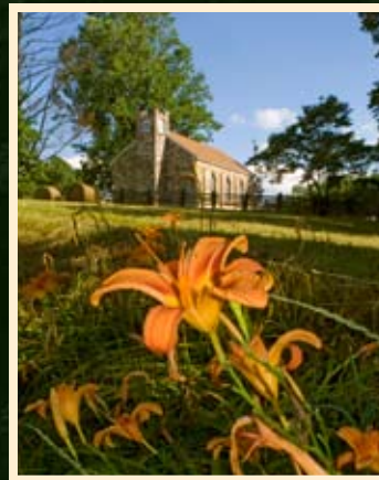
Mayberry Presbyterian Church, Meadows of Dan, Virginia, Milepost 180