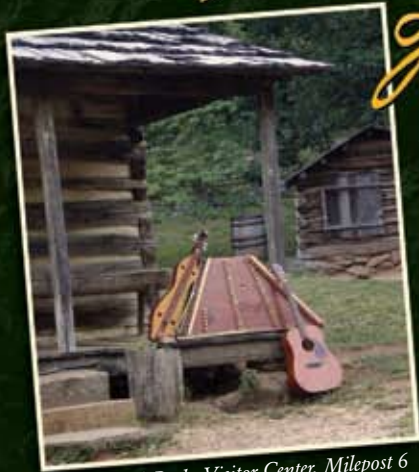
Humpback Rocks Visitor Center, Milepost 6